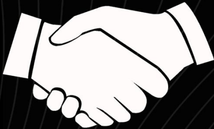
Teams, Partners, Sponsors